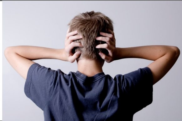
Loud / Hands Over Ears