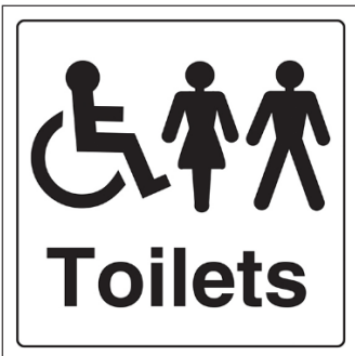
I Need The Toilet