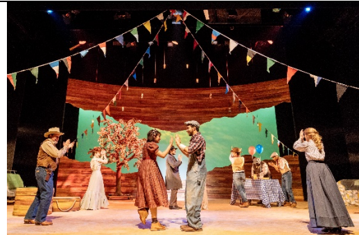
Actors on Stage