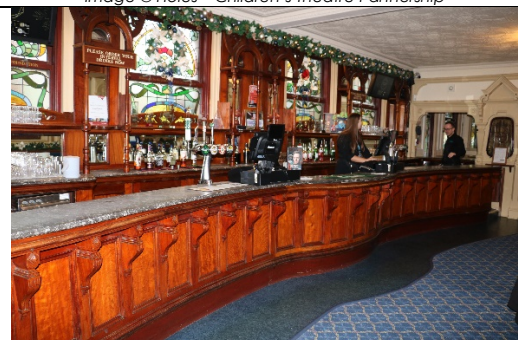
Bar (Dress Circle)