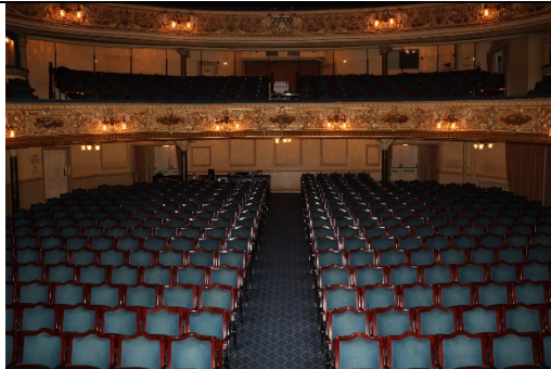
Inside Theatre (Auditorium)