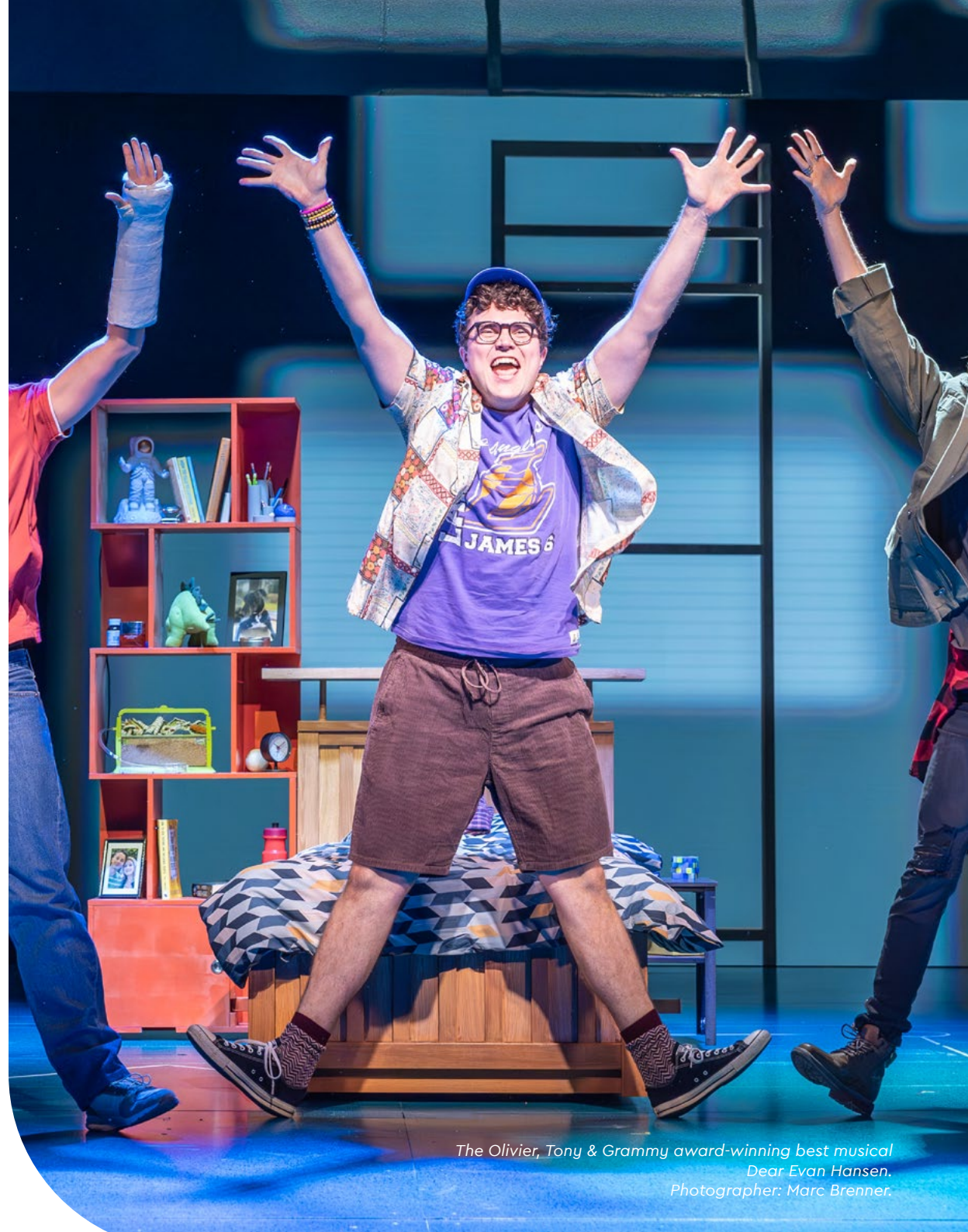
The Olivier, Tony & Grammy award-winning best musical Dear Evan Hansen.